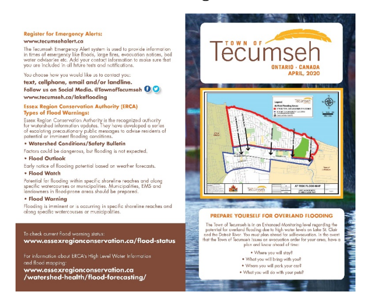
(Figure 1: Image of Flood Emergency Brochure)

In early March 2020, the Essex Region Conservation Authority (ERCA) advised Tecumseh and Lakeshore that the water level of Lake St. Clair was sitting 33 cm over the April 2019 levels and would not peak until June/July. This news spurred a number of activities to prepare for potential inland lake flooding. Detailed Flood Preparedness Action Plans were prepared to facilitate emergency response and public evacuation during a flood event, accounting for pandemic conditions. The Town's action plans included partnering with other municipalities in Essex County as needed and joint communications in the form of brochures were mailed to residences in flood prone areas. In early 2020, 4,000 residences in Town received information on how to protect their property from flooding, how to evacuate in the event of an emergency and where to get more information. (Figure 1) Additional sandbags were made available to residences along the shoreline.