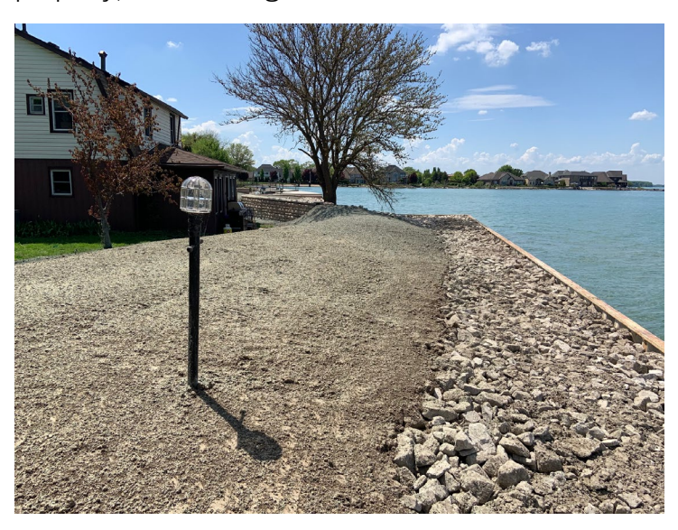
(Figure 2: Image of Clay Berm along Lake St. Clair)

The Town constructed clay berms on 14 properties along the shoreline that were identified as low-lying and posed a higher risk where lake water could enter into the Town. (Figure 2) These berms were tested over the course of the year when strong northeast winds prevailed and were successful in containing the lake water. Any breaches were contained to lakefront property, not crossing Riverside Drive.