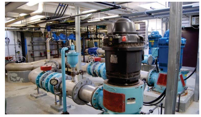
Pour plus de renseignements sur l'eau potable en Ontario, consultez le site www.ontario.ca/eaupotable

De nombreux documents utiles peuvent vous aider à exploiter votre réseau d'eau potable. Vous trouverez ci-après une liste de documents que les propriétaires et exploitants de réseaux résidentiels municipaux d'eau potable utilisent fréquemment. Pour accéder à ces documents en ligne, cliquez sur leur titre dans le tableau cidessous ou faites une recherche à l'aide de votre navigateur Web. Communiquez avec le ministère au 1-866-793-2588, ou encore à waterforms@ontario.ca si vous avez des questions ou besoin d'aide.